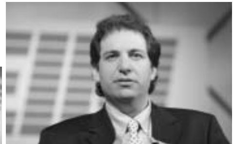
Author Kevin Mitnick concludes Monday's business session with a presentation on the ease of getting necessary information to invade computer systems in a variety of corporate settings. Using both technical and non-technical means, Kevin has gained unauthorized access to computer systems at some of the largest corporations in the world. His best-selling books are The Art of Deception and The Art of Intrusion .