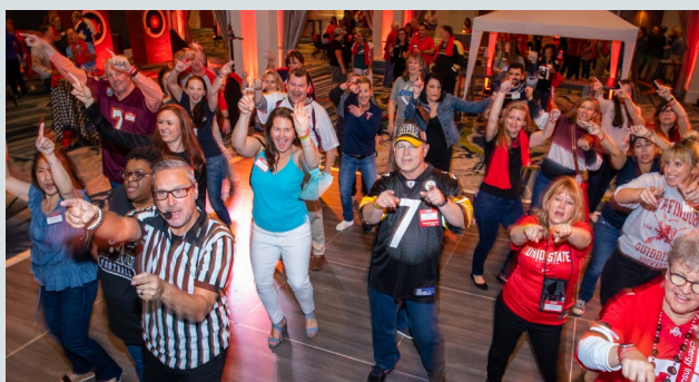
Attendees had a blast on the dance floor