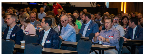
EIM attendees at the Grand Hyatt, Cypress

An energetic group gathered for the evening reception on Sunday, enjoying the opportunity to reconnect with friends, industry peers, and business partners. The opening reception was followed by a buffet dinner that included EIM's annual video highlighting a twist on Rod Serling's "Twilight Zone" television series that explored a "world without EIM." Stay tuned for the Emmy award nominations that will no doubt follow for EIM's talented staff!