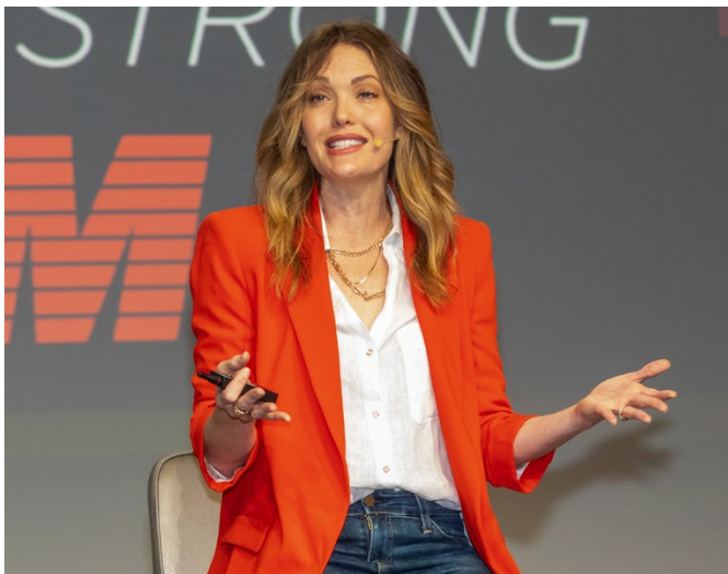
Amy Purdy inspires during the Tuesday morning session

Tuesday's morning session opened with Amy Purdy who inspired the audience with her experience of meeting and surmounting multiple challenges during her life.