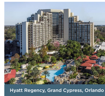
Hyatt Regency, Grand Cypress, Orlando