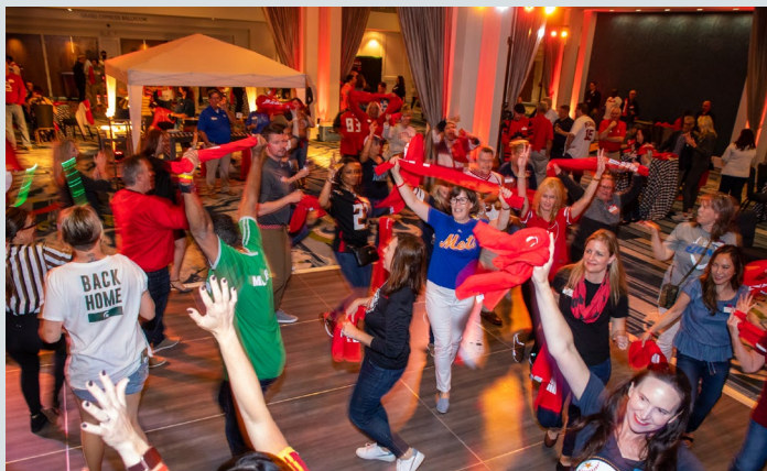
Attendees used their "rally towels" as props on the dance floor