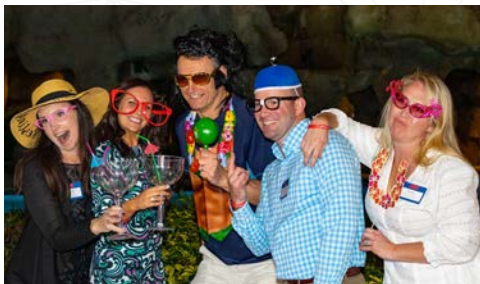
Joining in the fun and antics with some wild photo props