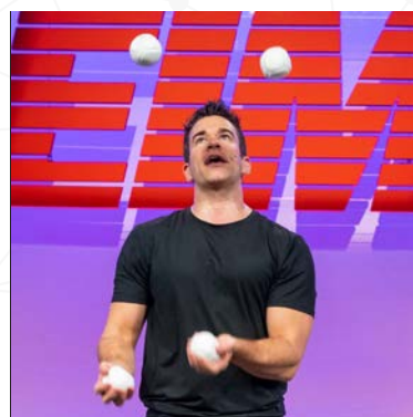
The world-class master juggler warming up