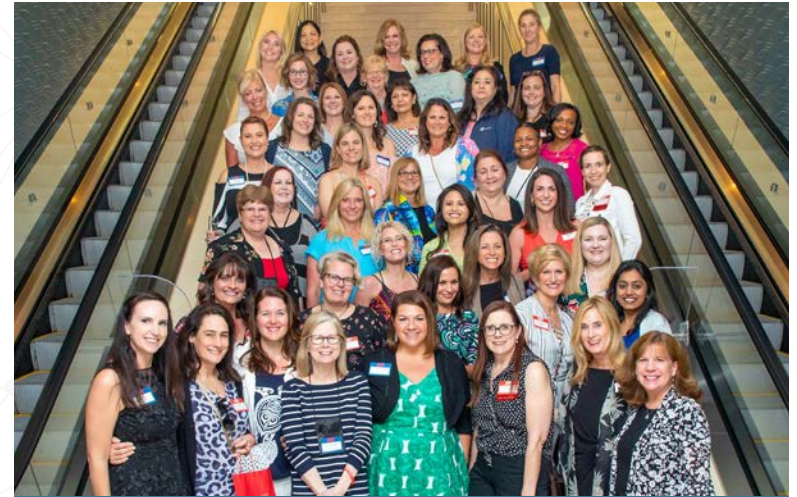
Attendees of the Women In Power event gathered near the Grand Cypress Ballroom.

This inaugural networking event gave attendees an opportunity to discuss the roles of female risk managers, brokers and underwriters in insurance and risk management. In the future, this networking group will host events with speakers for women, establish a mentoring network and raise money to award scholarships for young women in risk management programs.