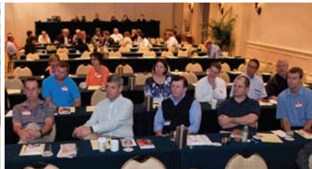
Emerging Issues breakout session.