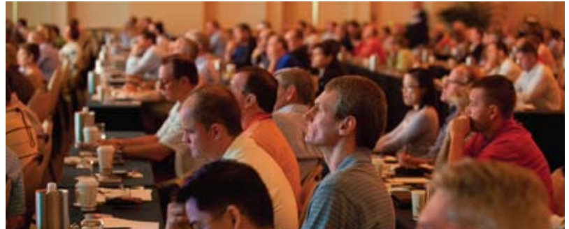
An estimated 200 Risk Manager representatives and Member brokers attended Monday morning's business session.