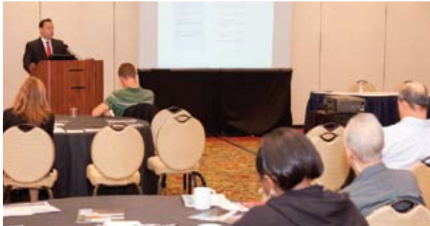
ERM breakout session.