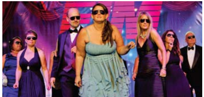
EIM colleagues were the main attraction at the EIMMY's.