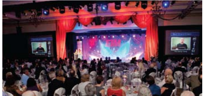
A glittering evening of solid entertainment.