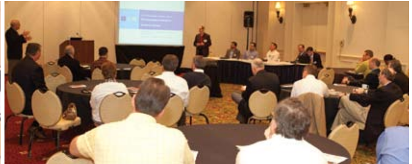
EIS breakout session.