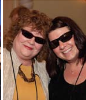
Looking good in Maui Jim sunglasses.